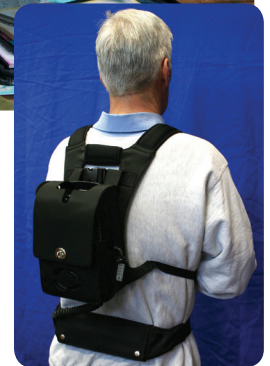
FreeStyle shown in convertible backpack, with optional AirBelt

Call 1.800.482.2473 or 1.800.874.0202 to order!